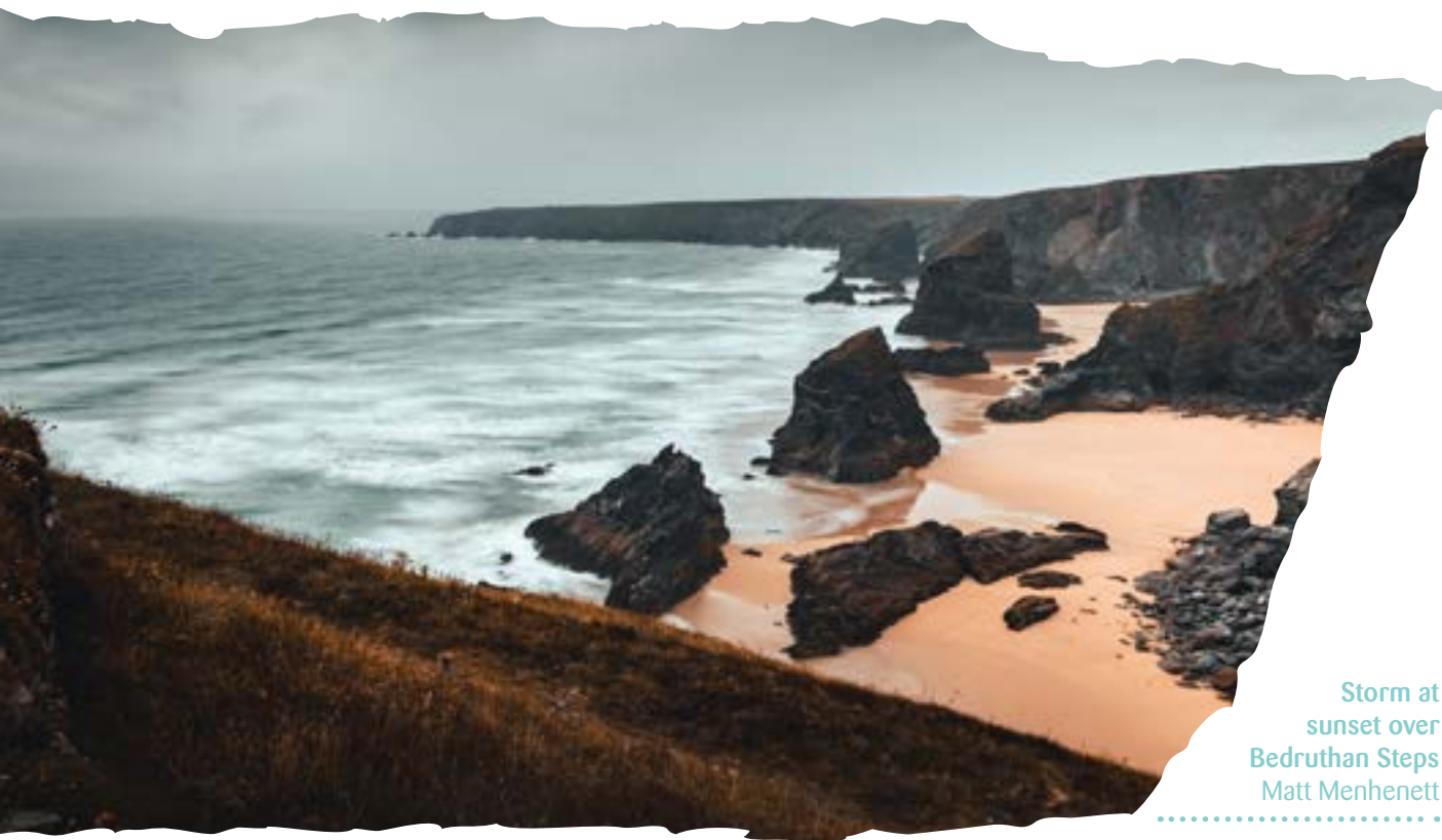
Storm at sunset over Bedruthan Steps Matt Menhenett